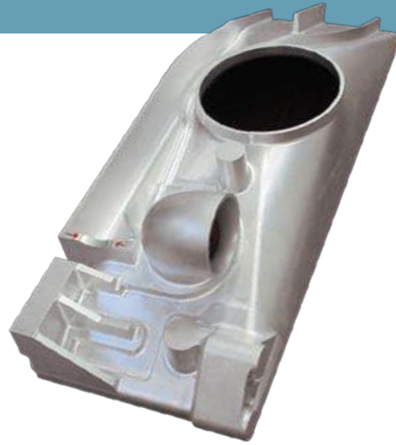
A five-piece weldment part that MAC Machine produces is difficult to machine because of the complex geometries of the unit.